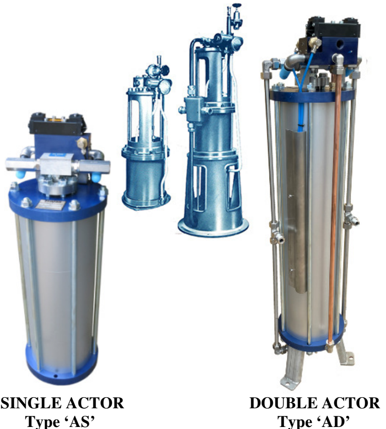
SINGLE ACTOR Type 'AS'

The long steady pulses and consequent steady rise in the system pressure make them the ideal pump for many applications.