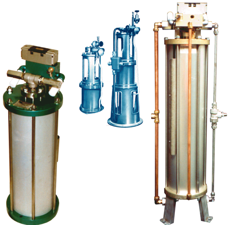
SINGLE ACTOR Type 'AS'