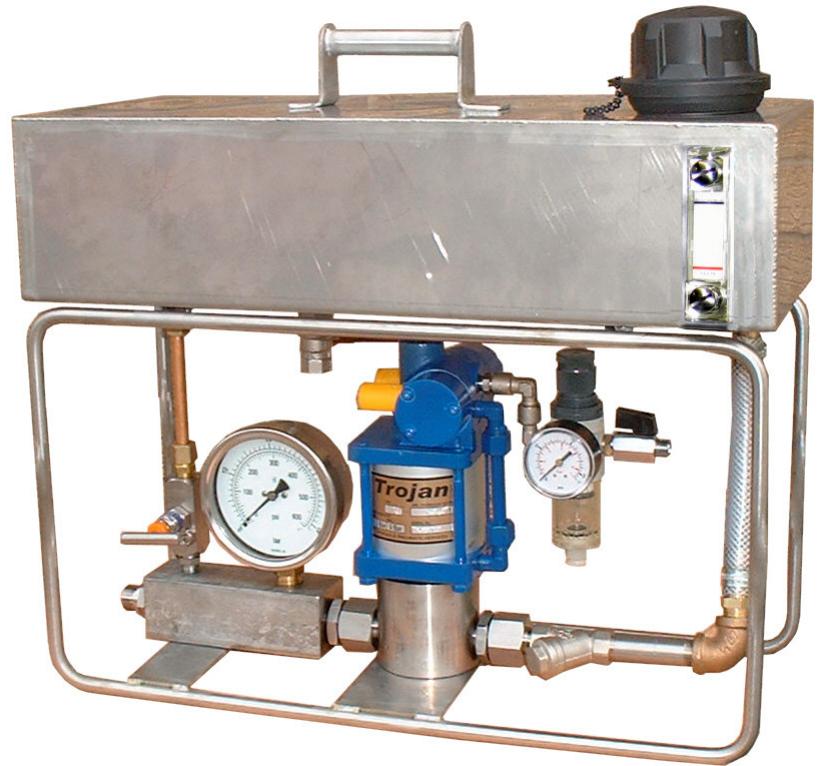
(Shown with optional Reservoir and Carrying Handle.)

Whether intended to be used as a mobile unit or installed in a permanent position the Portable Power Pack has been developed to provide a ready to use pressure testing rig.