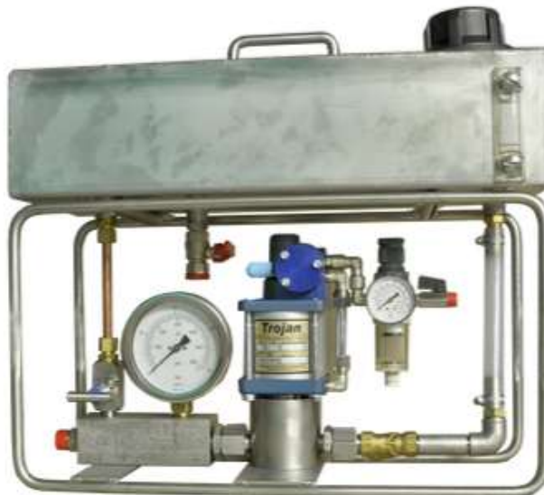
Trojan Type 'J' Portable Powerpack.