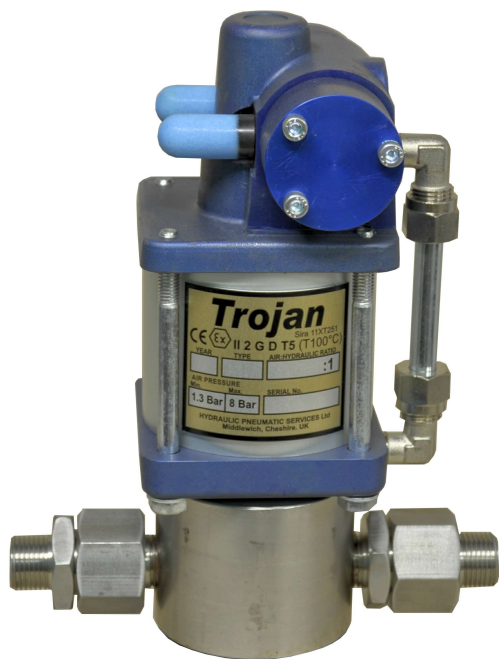
Trojan Type - 'J'

The smallest pump in the Trojan range, the Type 'J' is ideal for the smaller capacity applications. These air-operated pumps, are principally designed for pressure testing application but are also used by many OEM customers. The Trojan Type 'J' range, offers: